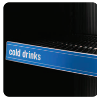
Clear, Hinged Menu / Price Strips