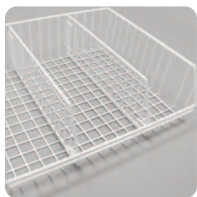
Wire Baskets and Dividers