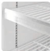
Clear, Hinged Menu / Price Strips